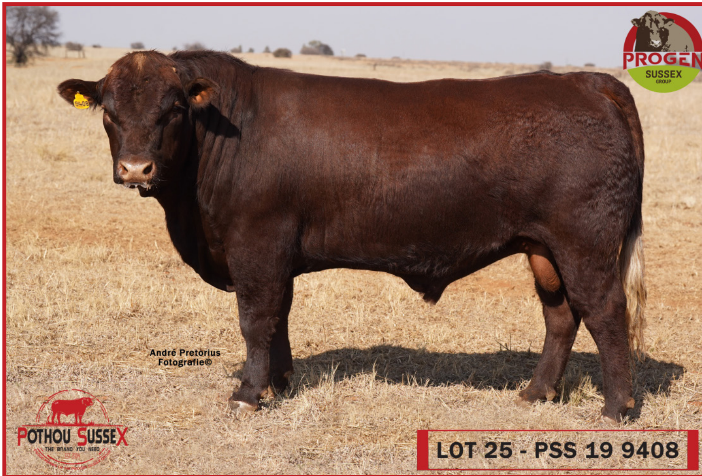
LOT 25 - PSS 19 9408