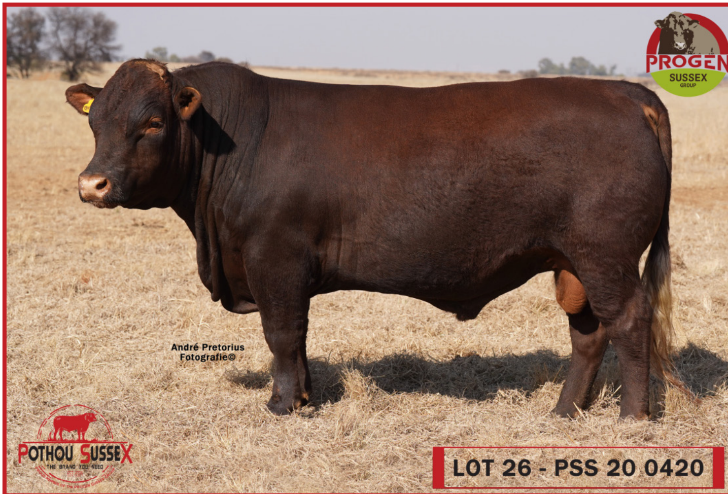
LOT 26 - PSS 20 0420

Semen donor: No Tests: Vrugaarheid, Vibriose, BM en Trichomoniose Vacc. Pasteurella, Ensietiese Aborsie, Spons-, Milt- en Lamsiekte, Stenkdalkoors, Pienkeye, BVD en Coxyrynebacteria