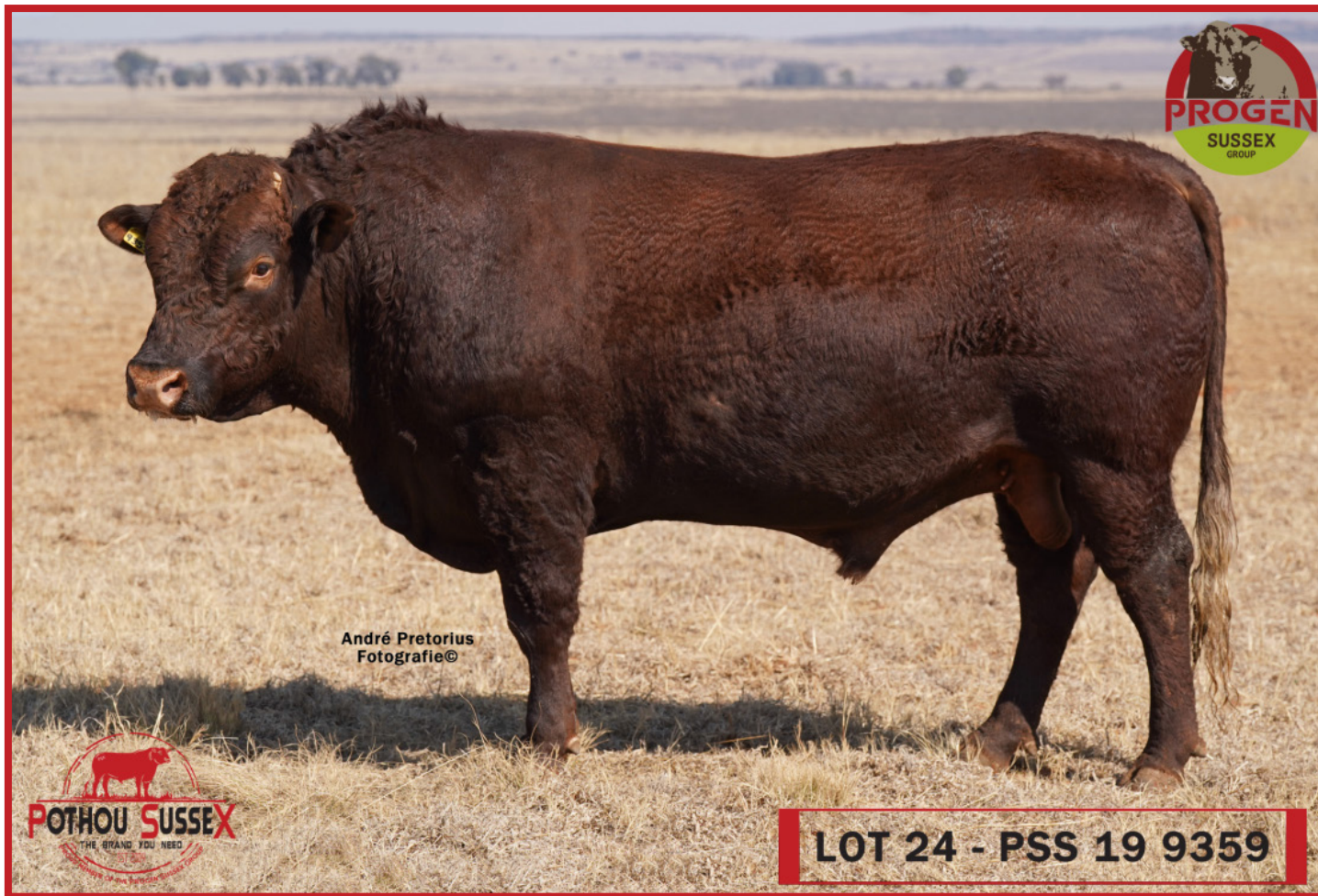
LOT 24 - PSS 19 9359