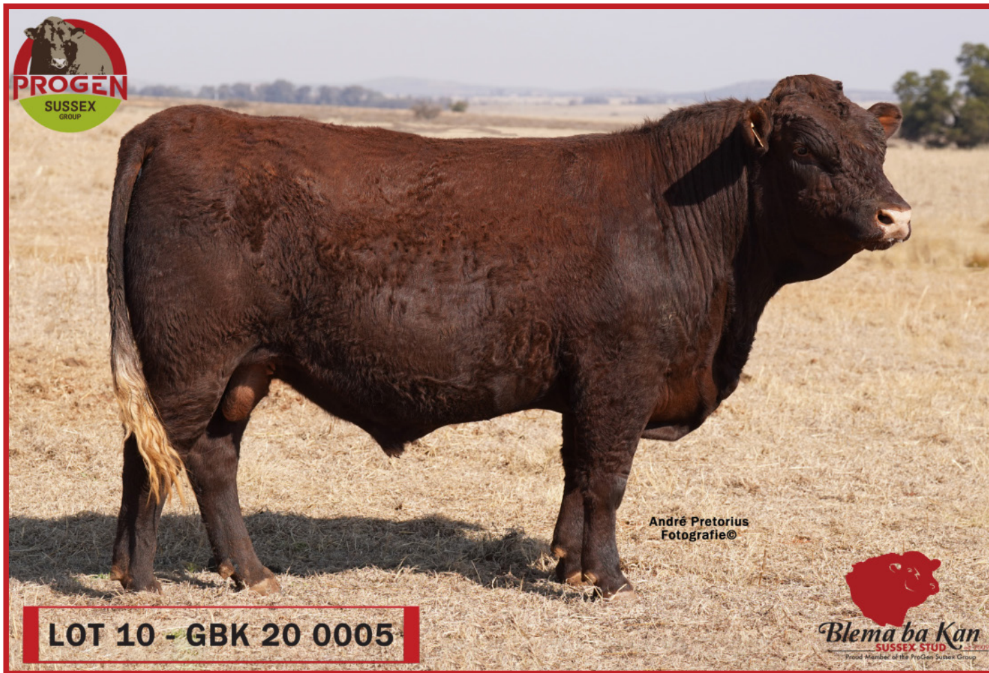
LOT 10 - GBK 20 0005