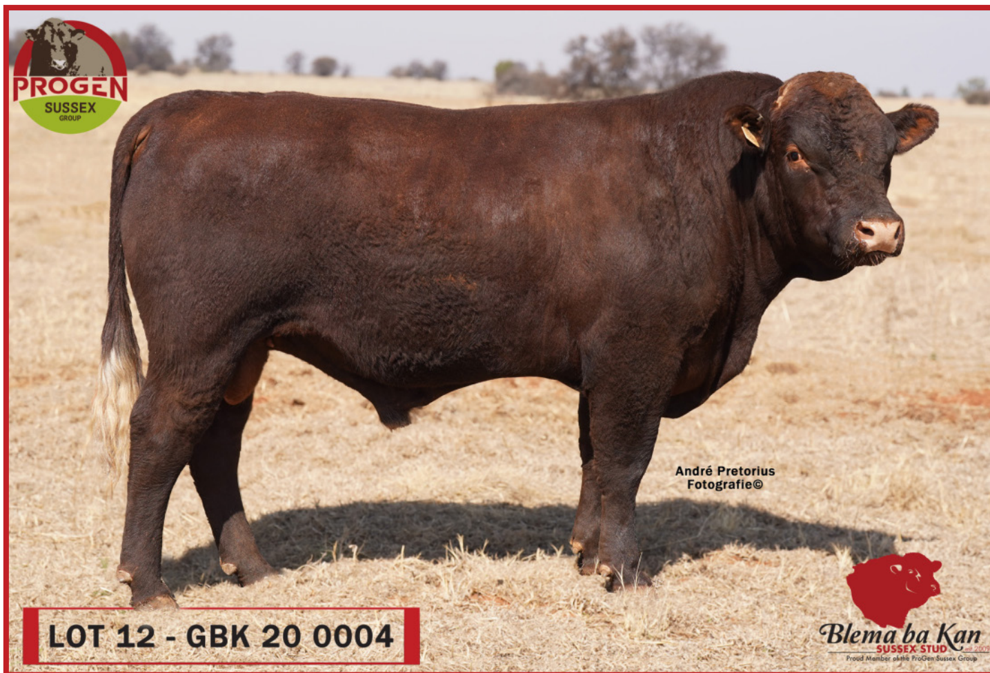
LOT 12 - GBK 20 0004

Semen skenker: Nee Toetse: Vrugbaarheid, Vibriose, BM en Trichomoniose Inent. Pasteurella, Ensietiese Aborsie, Spons-, Milt- en Lamsiekte, Stenkdalkoors, Pienkeye, BVD en Coxyrynebacteria