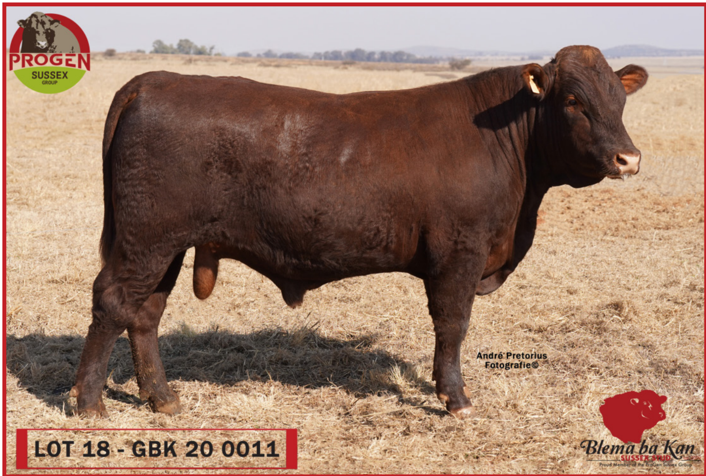
LOT 18 - GBK 20 0011