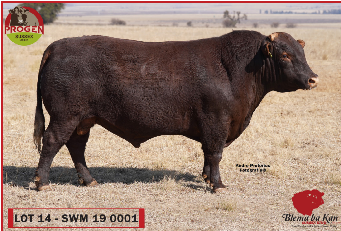
LOT 14 - SWM 19 0001