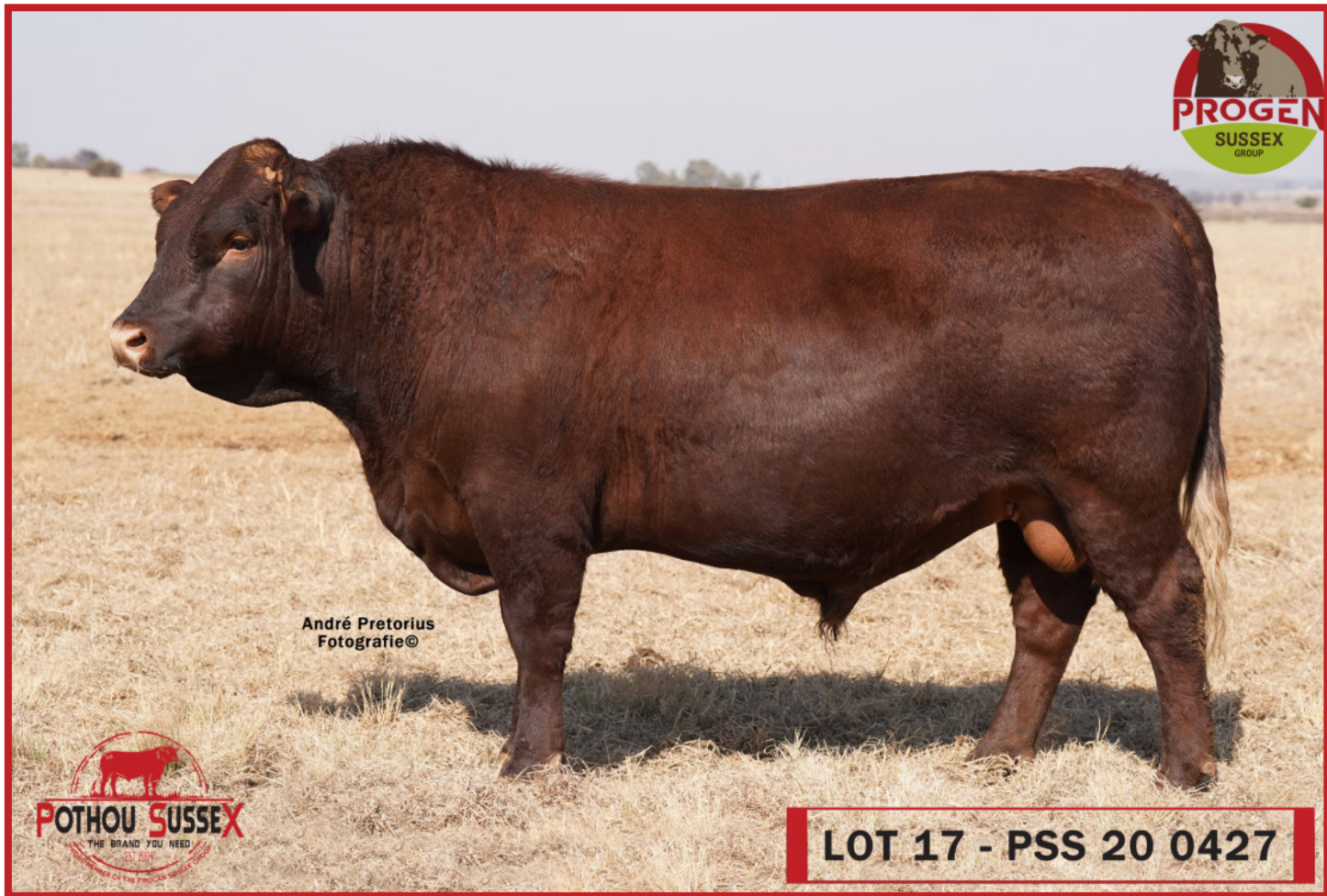
LOT 17 - PSS 20 0427